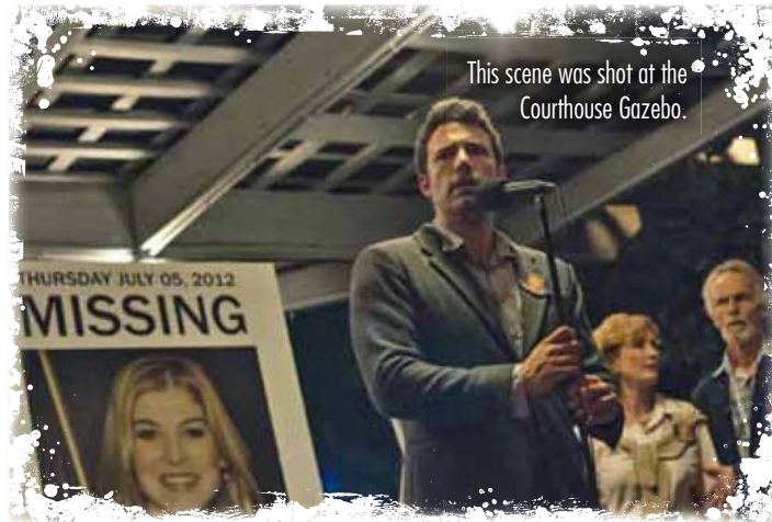
This scene was shot at the Courthouse Gazebo.

Continue west on Broadway for two blocks. Turn right onto Frederick. Travel north one block. Turn left onto Bellevue. The next site is on your left.